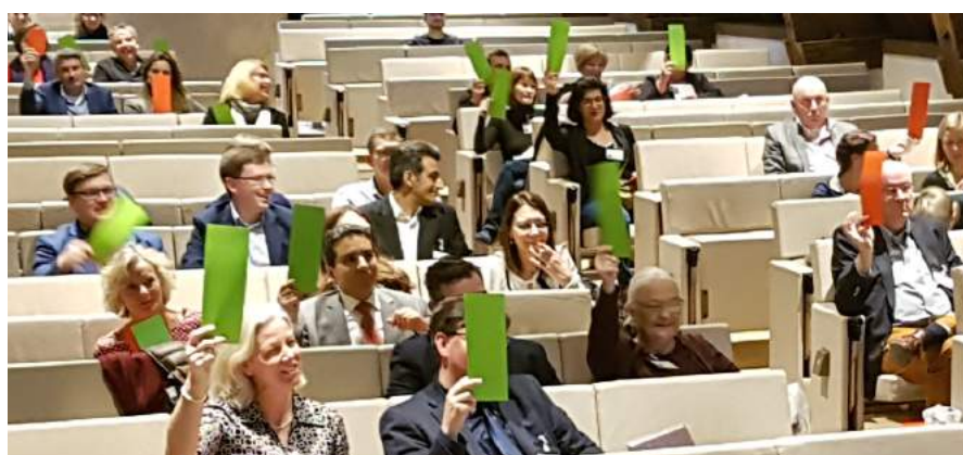
A voting and discussion session during the 2018 'Quality in the Spotlight' meeting in Antwerp

From a social point of view the mix between the next generation and the established colleagues was teaching, entertaining and generating enthusiasm. The discussions were vivid during the lectures and the breaks. Around 80 participants enjoyed each other's company. An interview on stage as well as an extensive plenary discussion led to useful and decisive conclusions that will be published.